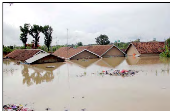
Caption: level of water in Lebak district.