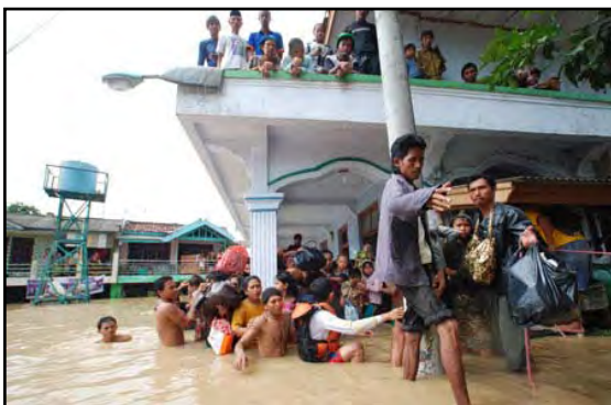
Caption: Started evacuating people trapped in the flood.